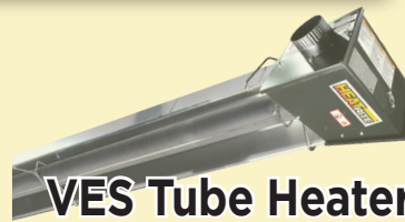
VES Tube Heater