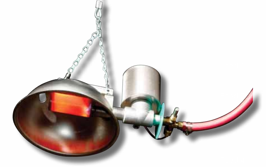
The M2 Infrared Heater with Standard Filter.