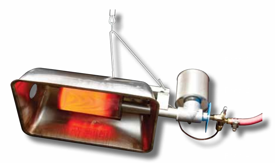
The M5 Infrared Heater with Standard Filter. Also available in a filterless model.