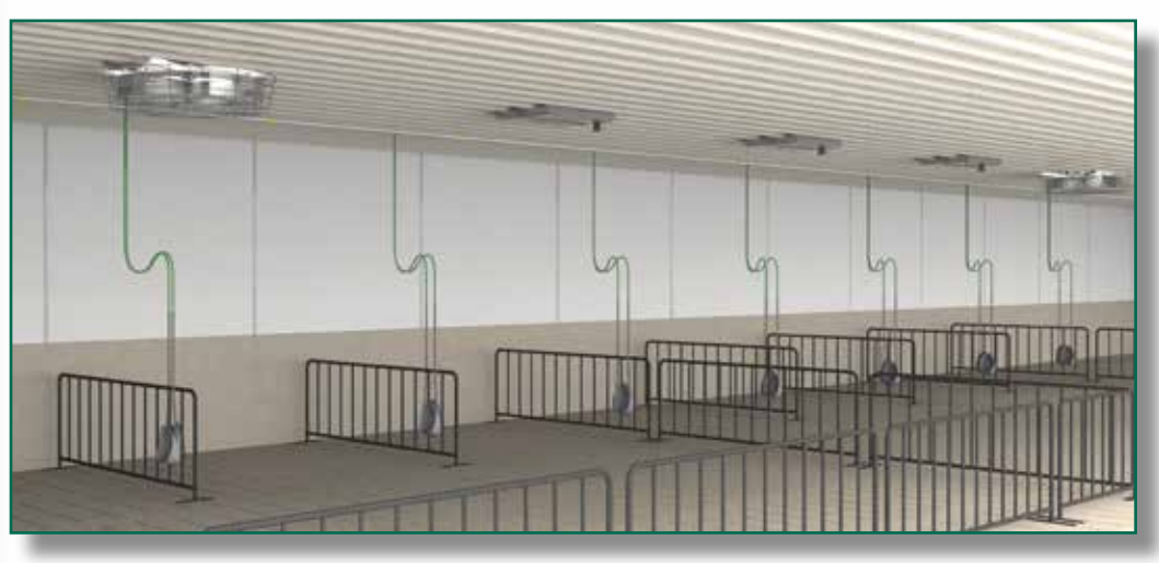
The Hemisphere Z-Pro in a swine application

Performance You Can Count On www.yal-co.com