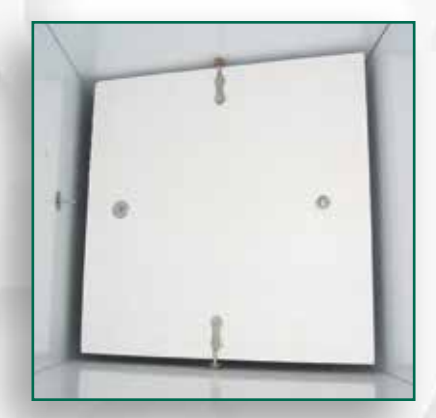
The Natural Flo Chimney Damper gives you precise control over exhaust.