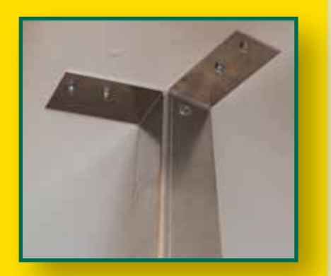
Aluminum corner brackets provide strength