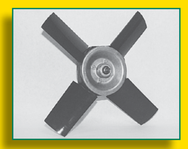
Composite Blades offer multi-wing design, cast aluminum hub and individual replacement blades