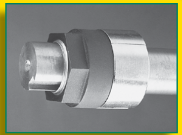
TranTorque Fitting locks tight on motor shaft, no set screws to loosen and allows easy change-out of blade and motor