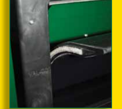
The side seals ensure the airflow is directed where it needs to be.

The VAL-CO® AccuFlow Inlet is the latest advancement in precision air distribution control for poultry and livestock facilities. Developed by combining powerful 3D design software, and digital airflow modeling technology, the innovative curved shape of this new inlet provides precise airflow control when coupled with modern control packages. This level of precision air control is increasingly necessary as today's structures become larger and proper distribution and mixing of inlet air is required to assure an optimized growth environment.