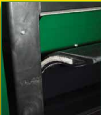
The side seals ensure the airflow is directed where it needs to be.

The VAL-CO® AccuFlow Inlet is the latest advancement in precision air distribution control for poultry and livestock facilities. Developed by combining powerful 3D design software, and digital airflow modeling technology, the innovative curved shape of this new inlet provides precise airflow control when coupled with modern control packages. This level of precision air control is increasingly necessary as today's structures become larger and proper distribution and mixing of inlet air is required to assure an optimized growth environment.