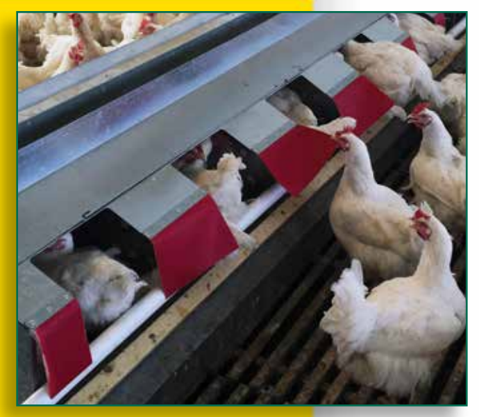
The Comfort Nest^{TM} is very inviting.