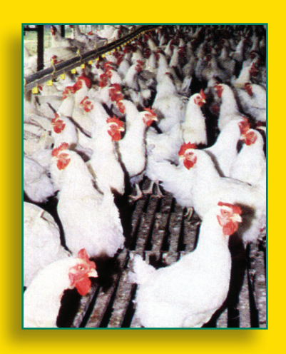
VAL-CO® can supply you with our World-Famous Watering System & our Top Performing Feeding System to help you get the best results.