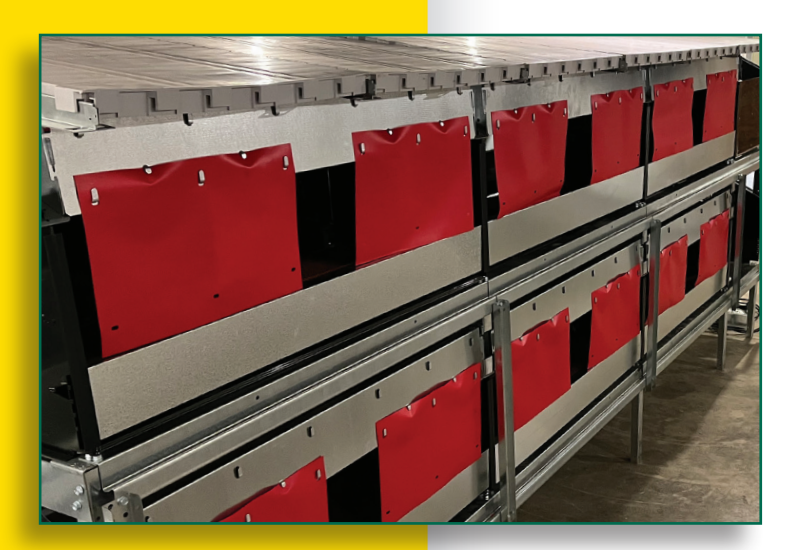
The 2-Tier Community Nest increases bird capacity within the same footprint (and can be wired into the same controls for ease of use!).