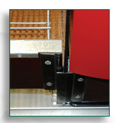
With slide together components, assembly is simple.