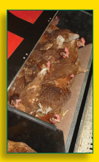
The Community Nest from VAL-CO is very inviting to your birds.