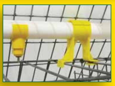
Pipe Support Bracket (Wire versions also available)