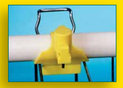
45° Closed Saddle