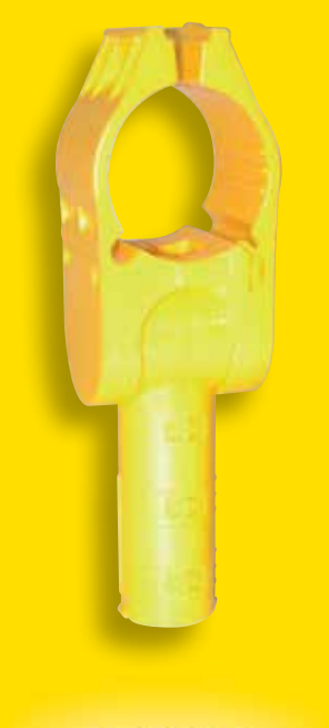
The Best Start II Chick Feeder