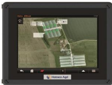
FORTLINK-S management display