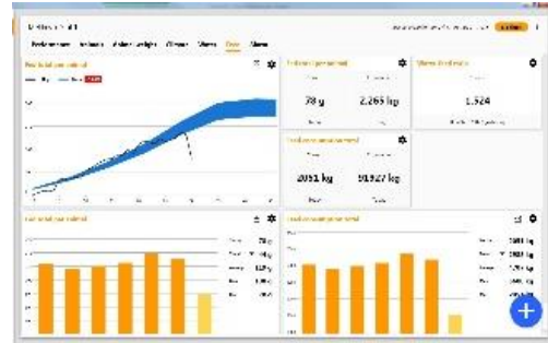
NOVUS Farm Management Software