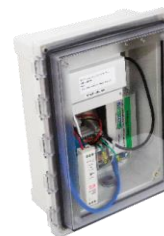
VLink Remote Access Node