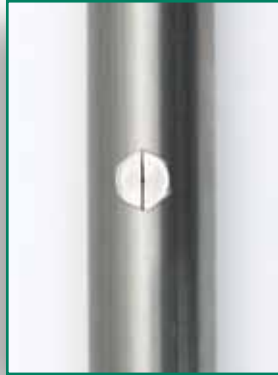
Specially Designed Nozzle

Package includes the Sentry Pump, Controller and Filtration System, Sentry Fog Nozzles installed in Stainless Steel Tube, Spray Wand, 2 Automatic Sensors and Chemical Injector.* You provide the disinfectant of your choice, platforms (to allow you to gain access to hard to reach areas with the spray wand) and the frame.