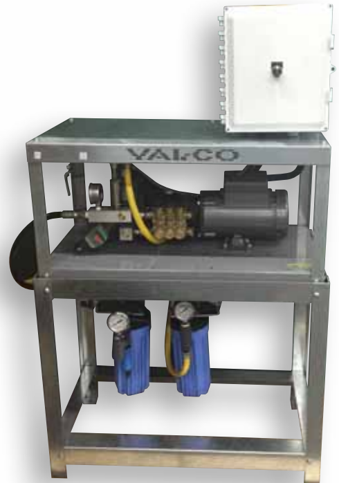
Sentry Pump, Filtration & Controller