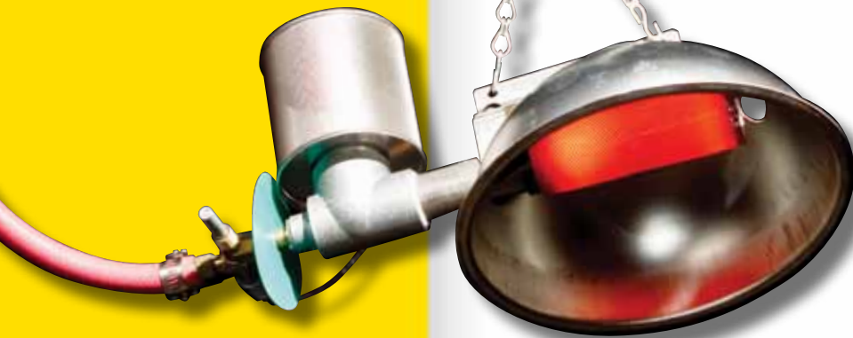
The M3 Infrared Heater with Standard Filter