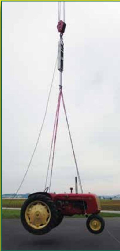
The ATLAS Curtain Machine is capable of safely lifting 4000 lbs. (1814kg).