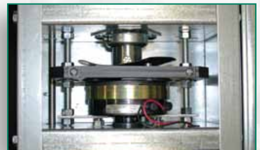
Above right: Clutch option available for Ball-screw machines.