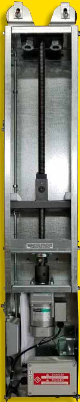
The redesigned weather-resistant ATLAS Curtain Machine now features an enclosed board and weather-resistant micro switches.