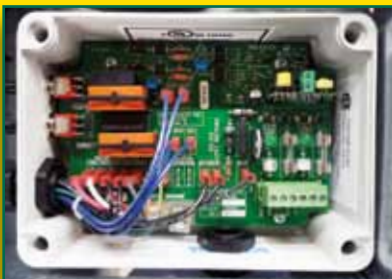
The rugged one-piece board is enclosed in a weather-resistant case providing protection in some of the harshest conditions.