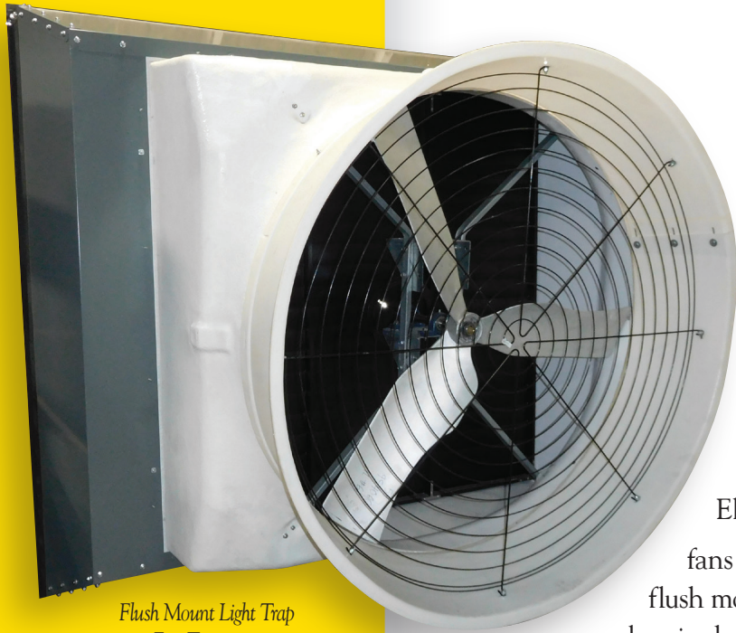
Flush Mount Light Trap Fan Transition