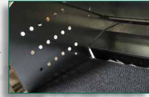
Partition holes provide ideal ventilation and the nest pads provide comfort.

leads to greater output of high-quality eggs. Ventilation holes in the partitions help provide an ideal environment. An expeller pushes birds out when necessary to aid in keeping the nest pads clean and help prevent broodiness.