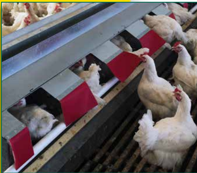
The Comfort Nest™ is very inviting.