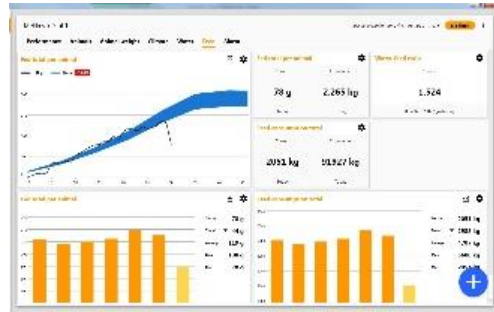
NOVUS Farm Management Software