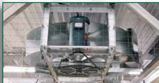
< Directional Hemisphere® - works in conjunction with your sidewall inlets.