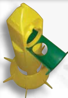
< FUZE® Shutoff- allows you to stop feed supply to individual feeders.