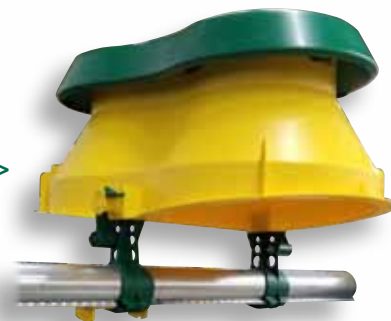
UltraStart™ Chick Feeder - > reinforced clamps keep the feeder stored on the line when not in use.