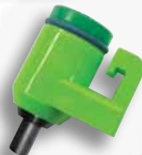
Aqua-V™ PFA Drinker - > an easy to trigger drinker for your pullets.