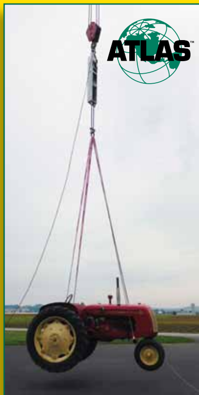
ATLAS™ Curtain Machine - capable of safely lifting 4000 lbs. (1814 kg.)!