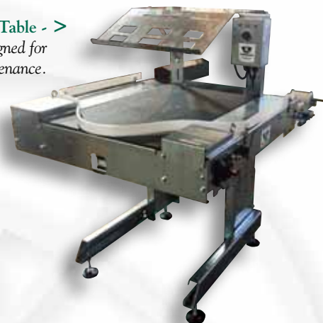
Egg Collection Table - > significantly redesigned for ease of maintenance.