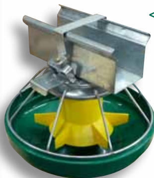
< Hanging Pan Feeders - increase available feed space on your existing flat chain trough.