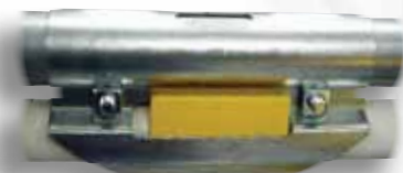
Anti-rotation Bracket - > helps prevent your watering lines from rotating.