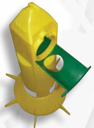
The FUZE Shutoff is available on both the single piece (shown) and two piece towers.