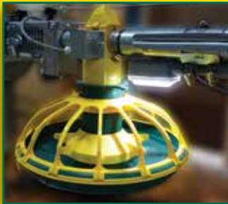
The LED light will attract your birds to the pans when it's feeding time.

The FUZE® ProLine Feeding System from VAL-CO® offers you the ability to do something you've never been able to do before... build your own feeding system.